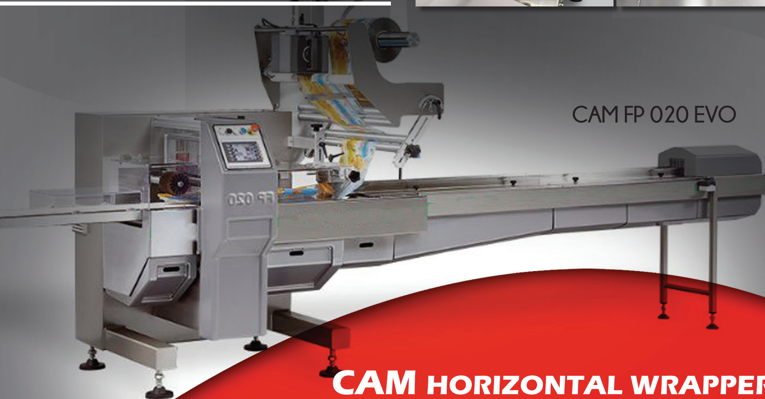
CAM FP 020 EVO