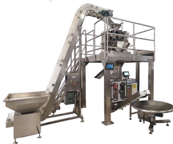
CV-420MN & 14MHW 1.6L