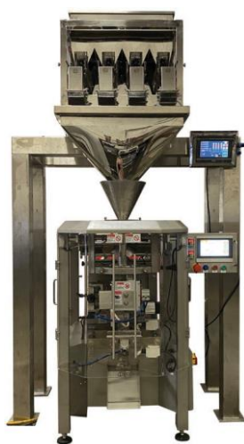
CV-3208-S3 & 4HL