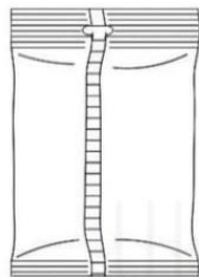
Pillow Pack With T-Euro Hole